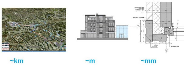
Figure 1: Relevant scale levels for Building Physics.