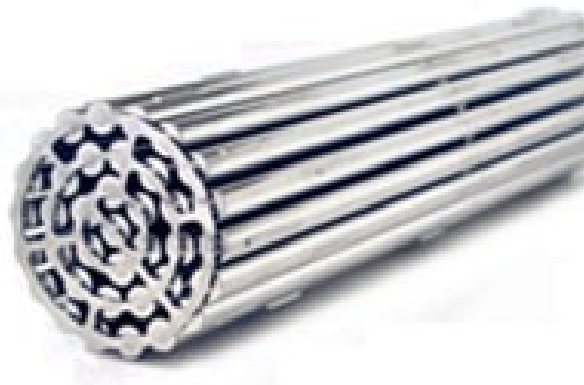
Figure 2: Fuel bundle with 37 elements [1].