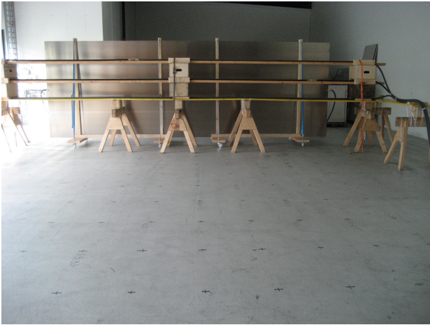
Figure 1: Experimental setup for measuring the effect of Al plate for shielding the magnetic field from a three phase cable system.