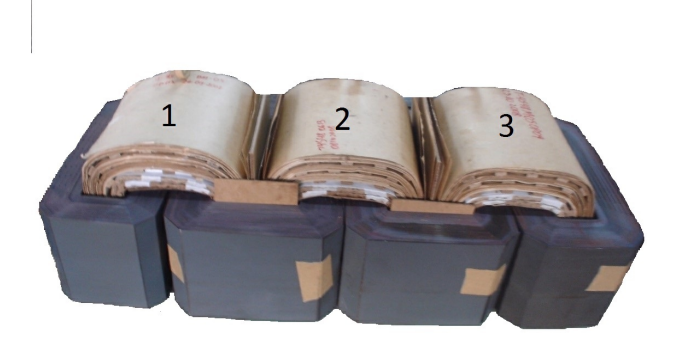
Figure 1: Core photo