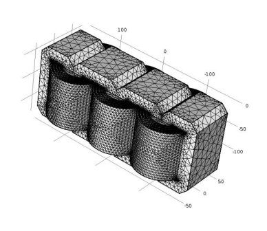
Figure 2: Mesh 546566 elements