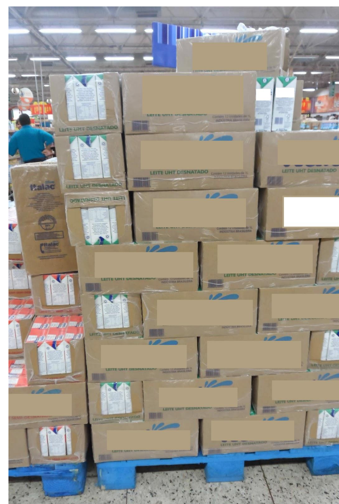
Figure 1. Storage Packaging

In the process of storage, these packaging deform plastically and elastic. Consequently, it was evaluated the deformation profile.